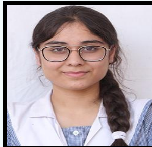
BOSKI BIRDI (91.2%)