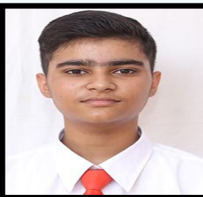
RANVEER SINGH (94.2%)