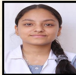
PRACHI COMMERCE (90.2%)