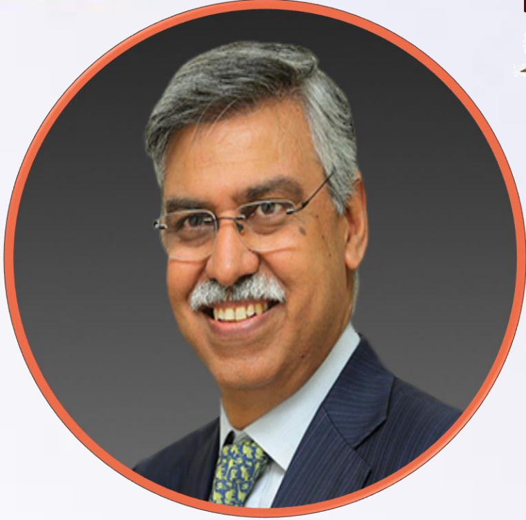
Mr. Sunil Kant Munjal Chairman SMC