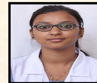
JYOTI JINDAL MEDICAL(92.2%)