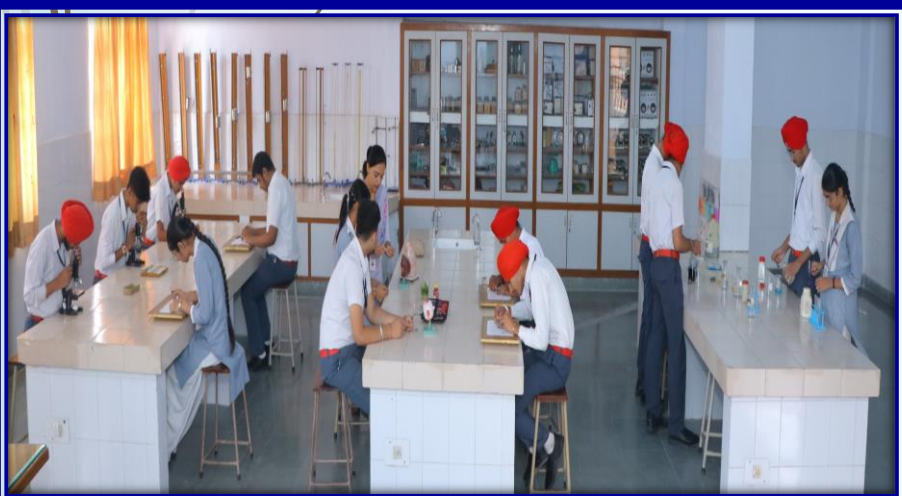
COMPOSITE SCIENCE LAB

The school has state-of-the-art laboratories. The equipment available in the advanced science (Physics, Chemistry, Biology and Composite) laboratories allow the students to interact directly with the data gathered. They get first hand learning experience by performing experiments on their own. All science enthusiasts are taught the practical applications through live demonstrations.